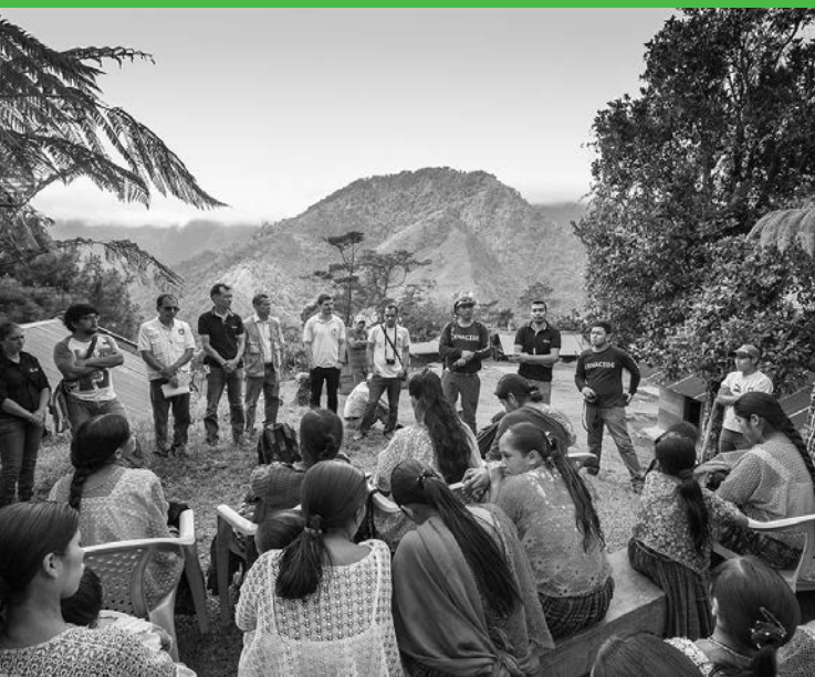
Guatemala: SETH Program, 2016